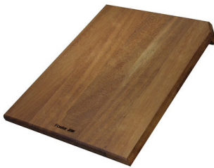
Chopping board 8656 001