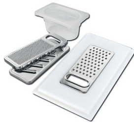
Grating kit complete with ring support and food collection tray 8159 101