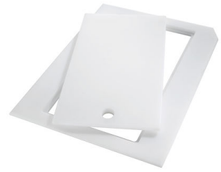
HDPE Twin Chopping Board 8644 100