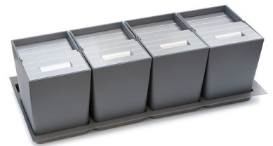
Four-bin kit for separate waste collection 8146 000