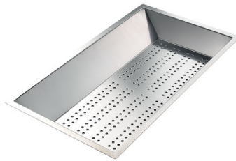
Stainless steel perforated pan 8151 000